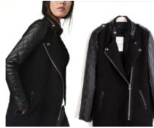
Winter Style: The Perfect Coat