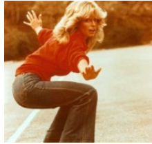
A Walk Down Memory Lane