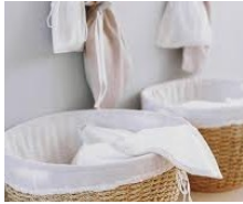
How To Extend The Life Of Your Wardrobe