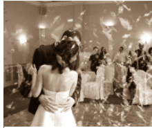
Planning A Big Wedding On A Small Budget